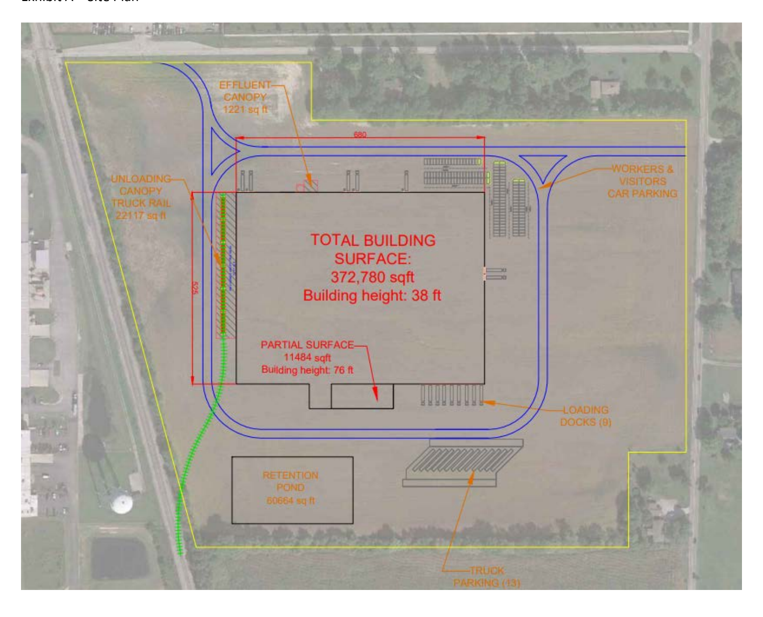
Exhibit A - Site Plan