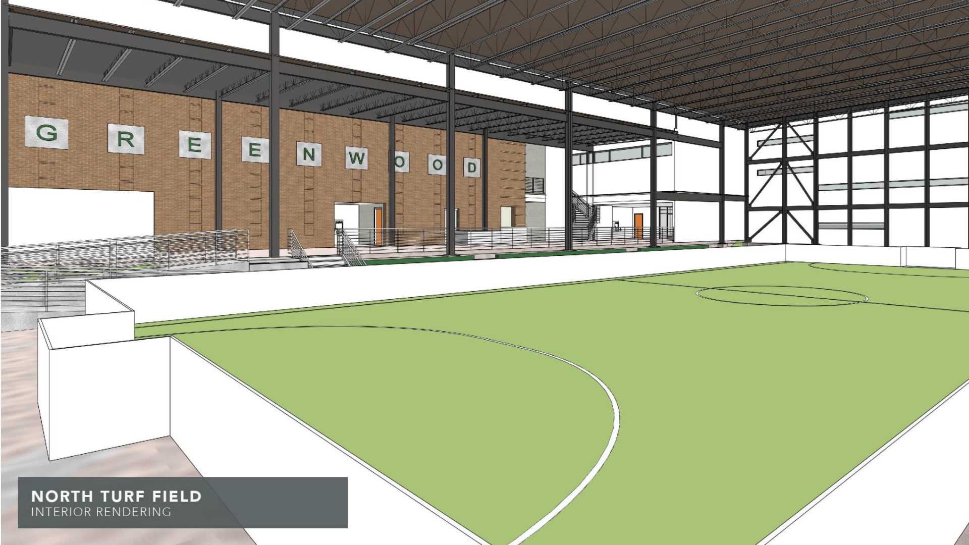
NORTH TURF FIELD INTERIOR RENDERING