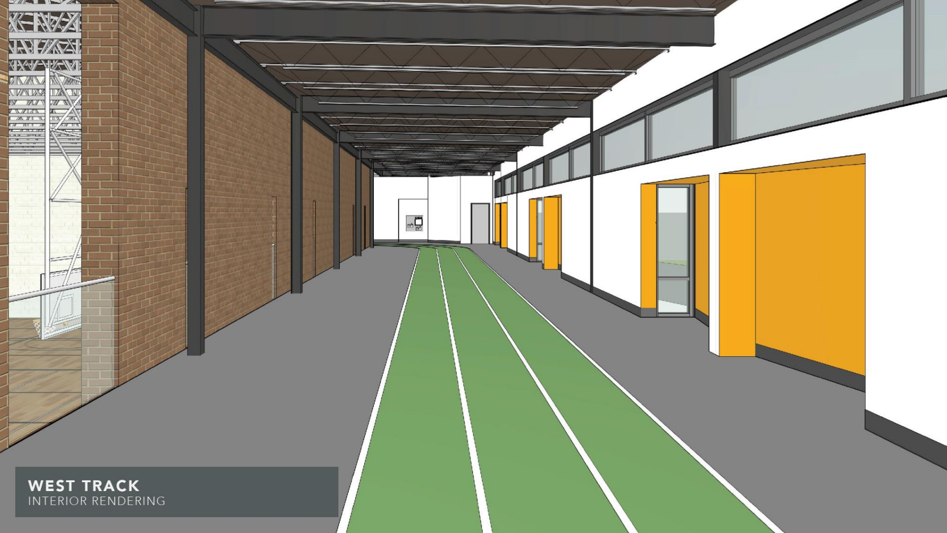
WEST TRACK INTERIOR RENDERING