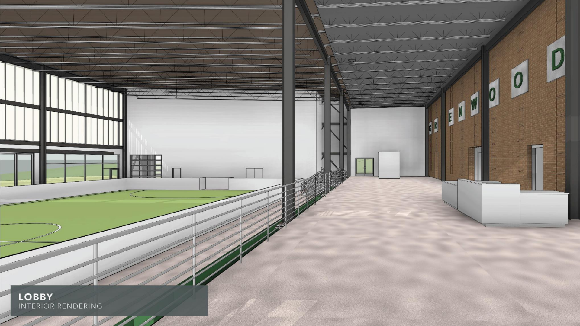
LOBBY INTERIOR RENDERING