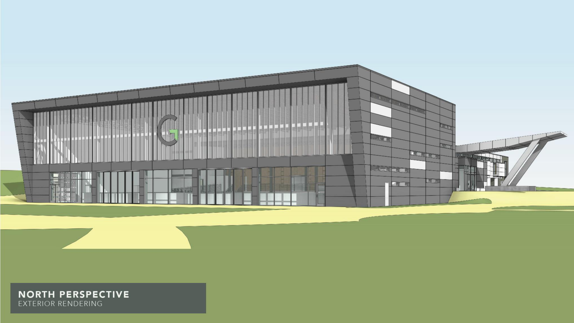
NORTH PERSPECTIVE EXTERIOR RENDERING